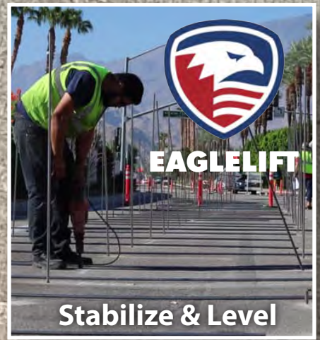
Stabilize & Level