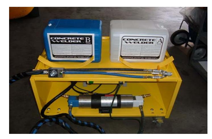
The Concrete Welder can also be configured for 2 five gallon units or 2-15 gallon units depending on job requirements

The Rheostat control controls the flow of polymer to the static mixing tube. It will always deliver polymer in an even ratio to the static mixing tube. Should polymer go off ratio then check that the A and B side flow regulators (numbers 5 and 6 in the gun assembly diagram) are in the fully opened position or that there is no obstruction in the polymer lines.